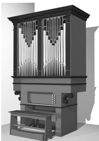
Rendering of seven stop tracker organ for Wesley United Methodist Church - Elkton, MD

It is a rare company that can encompass the best of it all, yet this is our goal.